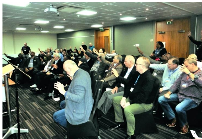
Leaders in prayer at the Full Gospel Global Forum Annual Global Prayer Summit held at Heathrow, near London.

For he will command his angels concerning you to guard you in all your ways;