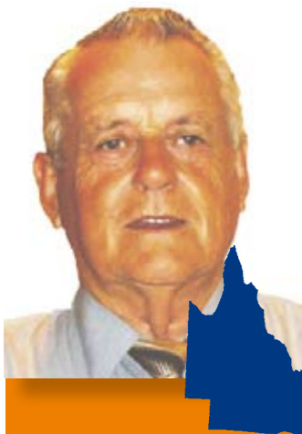
...the group at Charters Towers amazes me how with three members they host functions forty to fifty strong.